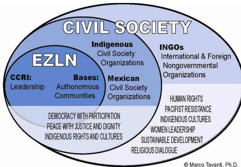
The Zapatista Movement and Civil Society Organizations

Zapatista autonomous communities usually do not participate in political elections. Some of these bases, as in the case of the case of Polho in the municipality of San Pedro Chenalo, continue their resistance and firm opposition to military and government authorities by remaining in the refugee camp and not returning to their original communities. CSOs, instead, have taken a different stand regarding political